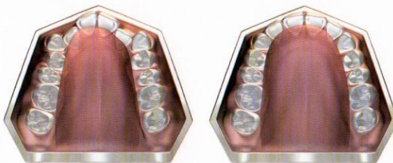
CROWDED UPPER ARCH

The function of the tongue, cheeks and lips determines tooth position. Correct facial growth depends on correct function and breathing patterns.